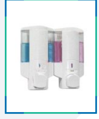
KK-SD-06-Twin 450ml each