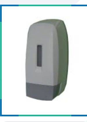
KK-SD-08-500ml & 1000ml