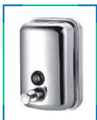
KK-SD-05C-SS-500ml & 800ml