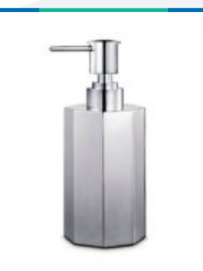
KK-SD-SS-03 500ml-Table top