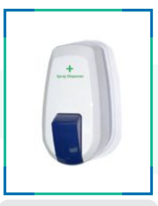
KK-SD-23-500ml Sanitizer Disp